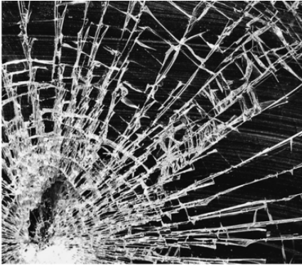
Political Education doesn't come from reddit What You "Learn" Will Be Wrong