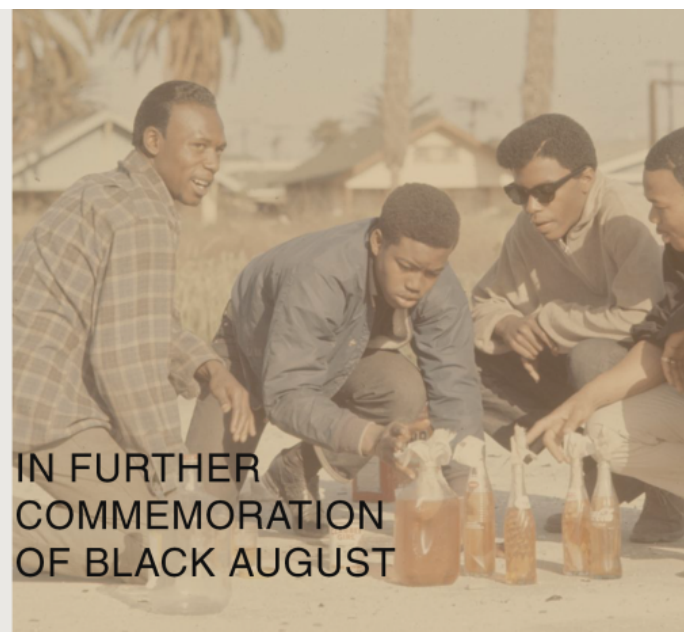
"History, fortunately, dispels all doubts and clears up all ambiguities." — Jose Carlo Mariategui. [JCM2]

In our previous article, <u>The Black August Contradiction</u>, the history of repression and rebellion within the Black Nation is detailed. In this follow-up, we theorize the centrality of the Black Nation within the overall struggle for national liberation and socialism in the territory occupied by the United States.