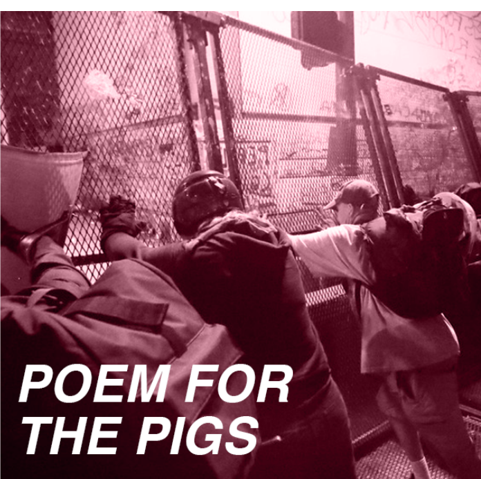
By 3/4 dead

Officer, you are a pig... Because you have denied us the dignity of humans with your batons and formations with your law and your order