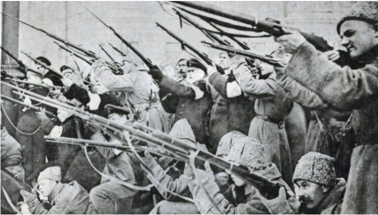
Bolshevik Red Guards in October 1917

reorganized tsarist troops, and of organizing Soviet power in the many localities wrested from the White armies. Stalin shared his rich experience acquired as a field commander in the Civil War, and encouraged other Soviet commanders to draw from their experience of partisan warfare (e.g. a growing understanding of deep operations with a peasant rear in a long war) and systematize these in the fledgling institutes of military science and training.