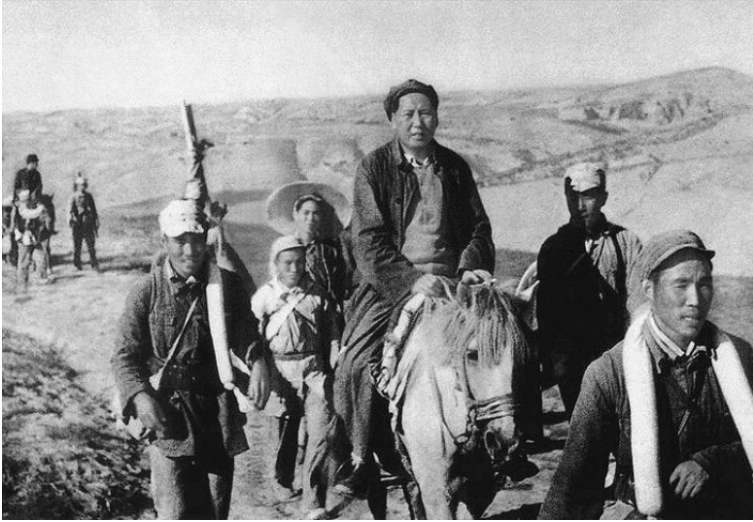
Mao moves his headquarters away from Yanan with the CCP-led People's Liberation Army in the increasingly mobile warfare during the homestretch of the second revolutionary civil war vs. the US-backed Guomindang armies of Chiang Kai-shek.

We hope that disseminating these materials among a wider range of anti-imperialist, socialist, and other progressive activists will contribute to a deeper understanding and appreciation of Mao's theory of protracted people's war. Its real historical impact and validity among countries and peoples fighting for national liberation and people's democracy on the long road to socialism takes additional relevance as we commemorate the 70th anniversary of that earth-shaking victory of a great people's war.