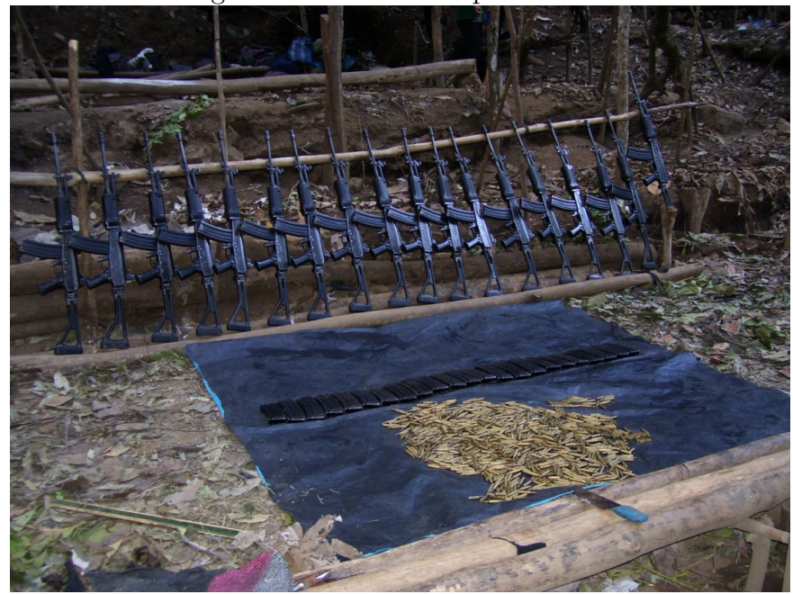
Ambush at Tintay Puncu. Tayacaja. Huancavelica. 09 October 2008.

Weapons confiscated on October 2, 1999. Mine Sector. Rio Saniveni. San Martín de Pangoa. An MI-17 helicopter No. 633 ambushed.