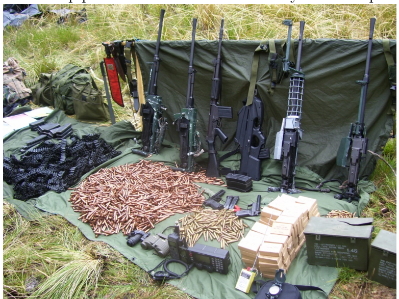
Demolition and ambush in Sinaycocha. September 2, 2009. Santo Domingo de Acobamba. Junín. Helicopter MI 17 FAP No. 640.

So, what was the so-called defeat of the Shining Path, defeat of terrorism, peace accords, national pacification and many other diatribes? We firmly believe that all this is infamy against the Party. With revolutionary fervor we spread the red flags of rebellion to the wind. Long live the People's