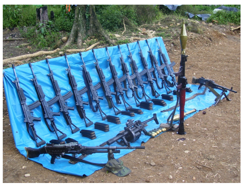
Ambush in Ccompipata. Sanabamba. Huanta. Ayacucho. April 9, 2009.