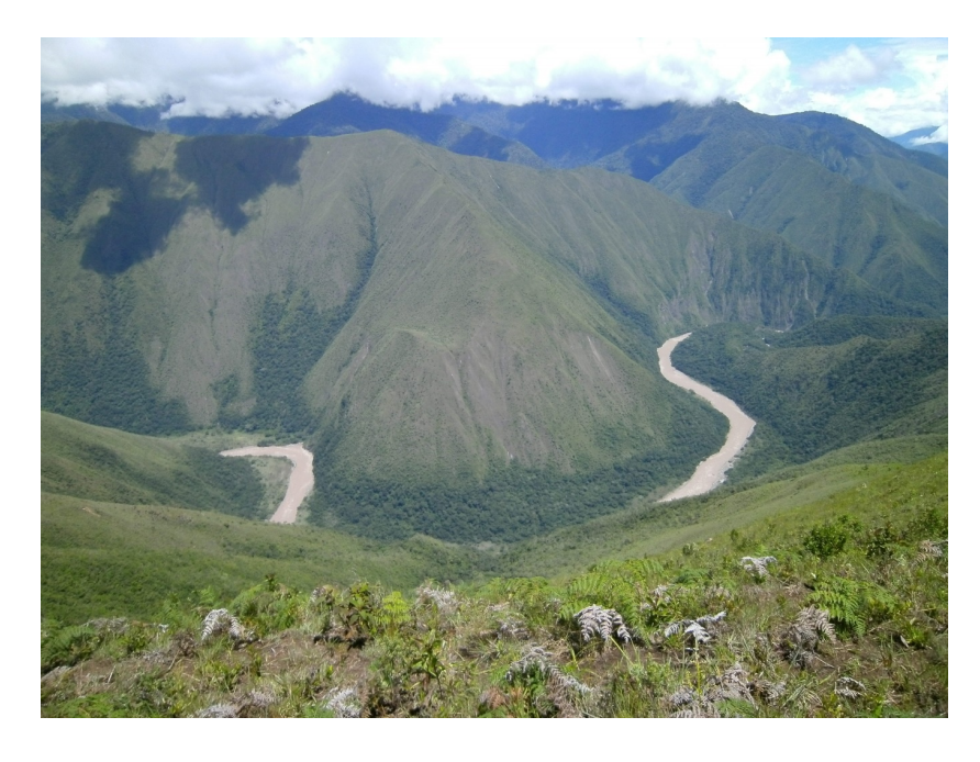
Peru People's Movement (Reorganization Committee) MPP (CR) March 2017