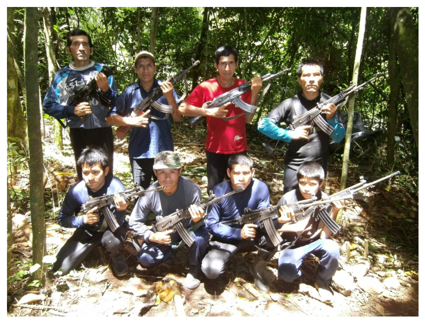
Combatants of the Popular Liberation Army, in the sector

In a war, the loser is the one who asks for a dialogue. With double intentions: one, through a truce, to regain strength, find a respite and then launch a furious counterattack; another feels lost and what he wants is to preserve part of his interests at a negotiating table, to conserve part of his strength and at a later time to attack again. Thus, too, restorations occur.