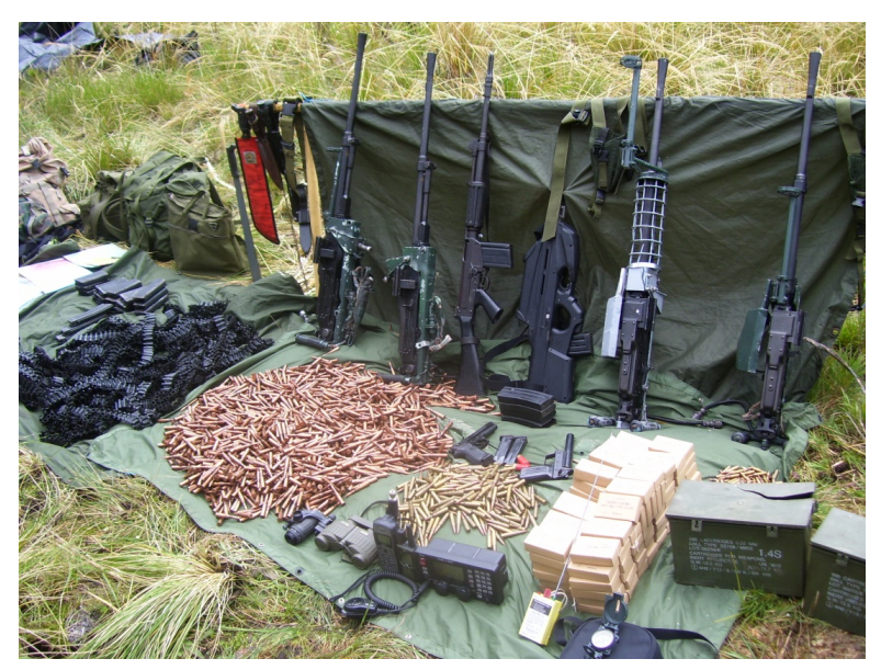
Demolition and ambush in Sinaycocha. September 2, 2009. Santo Domingo de Acobamba. Junín. Helicopter MI 17 FAP No. 640.

So, what was the so-called defeat of the Shining Path, defeat of terrorism, peace accords, national pacification and many other diatribes? We firmly believe that all this is infamy against the Party. With revolutionary fervor we spread the red flags of rebellion to the wind. Long live the People's War! It is Right to Rebel! Take the skies by storm! Our invincible weapon: Marxism-Leninism-Maoism, Gonzalo Thought. The reactionaries say: Lay down your weapons. We answer: Come and take them. Once again we raise Chairman Mao's slogan to the top: "He who is not afraid of death by a thousand cuts dares to unhorse the emperor."